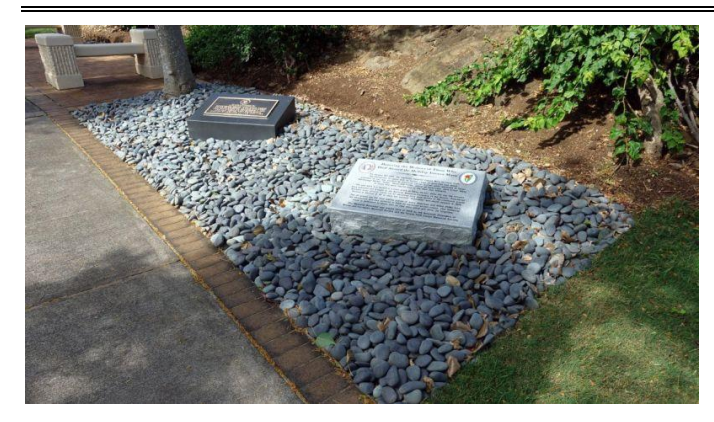
The Enoura Maru Stone on the Memorial Walk at the Punchbowl Cemetery in Hawaii.